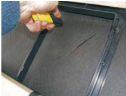
Two diagonal cuts are made from each corner.