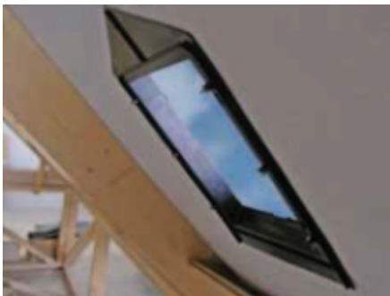
The Underlay collar from the inside.