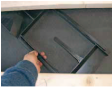
The top element is installed between the rafter and the underlay