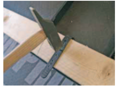
The snip is attached with the nails that are included in the package