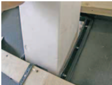
Iso tubes are inserted through the pipe passage. To close air flows around the iso tube, foam can be foamed or filled with traditional insulation.