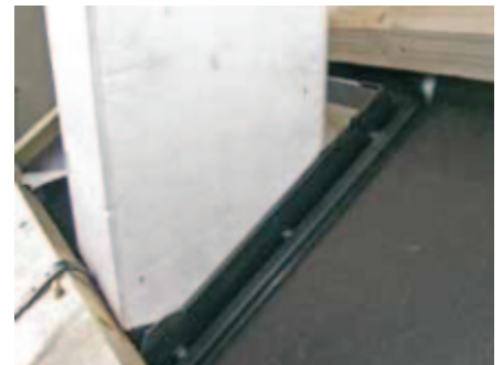
The underlay collar is fully assembled from the outside.