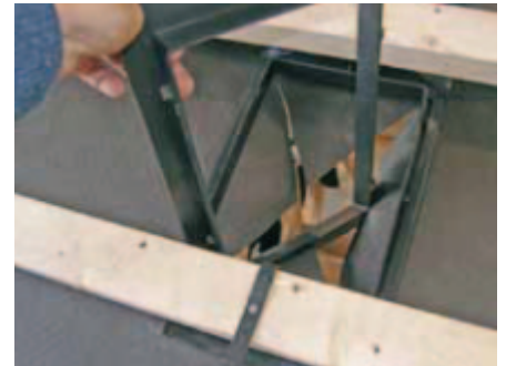
The lower element is inserted through the hole, clicked firmly and screwed into the screw holes with the supplied 35 mm. screws.